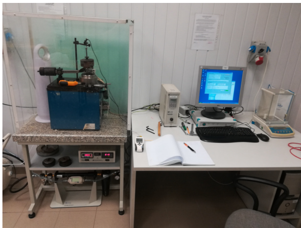
Fig. 1. Test stand

The object of the study was samples of prototype friction material containing dried rye stalks, which are currently widely used in industry [24-26]. They were obtained as waste after the threshing process. The stalks were shredded into fragments about 3-5mm long. A total of 5 samples with different percentage of rye were made: 0, 5, 10, 15, 20 % of total material weight. Proportions were measured using a scale (Fig. 1). The exact composition of each sample is summarized in Tab. 1. The samples were made as cylindrical objects with a diameter of 1" and a height of 10 mm. Steel discs were used as the basis, which greatly facilitated the sample production process (Fig. 2).