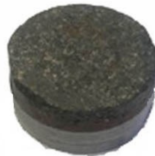
Fig. 2. One of the samples